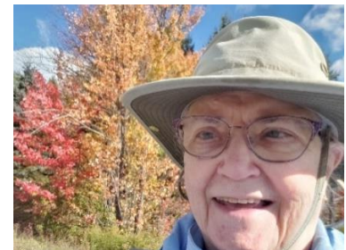
& Fall at Looking Glass Pond