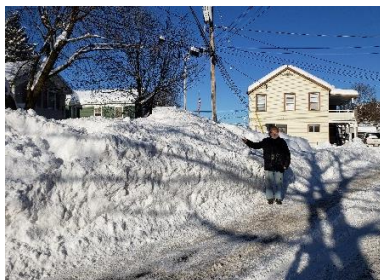
Winter in Middleburgh