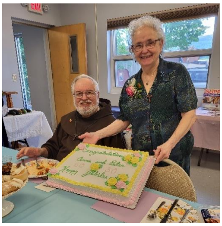
Jubilee Cake at Our Lady of the Valley