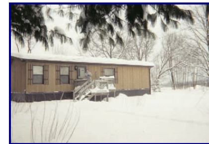
Winter in Middleburgh, NY.

Since then it has been presented many times in New York, New Jersey, Pennsylvania, Mississippi and in Canada for a wide range of people including two Native American groups, a variety of parishes and ecumenical gatherings. See our website for more specific information about this presentation.