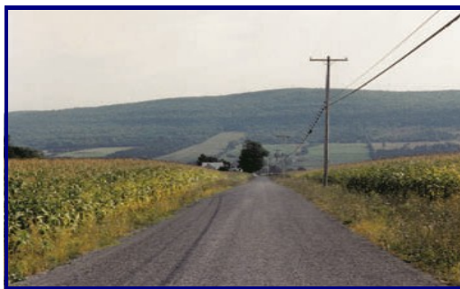
Mill Lane going toward main road.

Prayer, Proclamation and Hospitality are the three principal activities of Bethany Ministries.